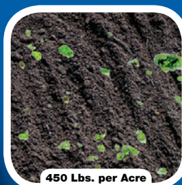
450 Lbs. per Acre