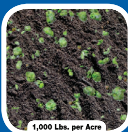
1,000 Lbs. per Acre