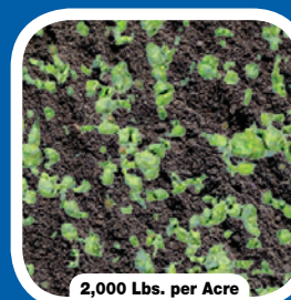
2,000 Lbs. per Acre