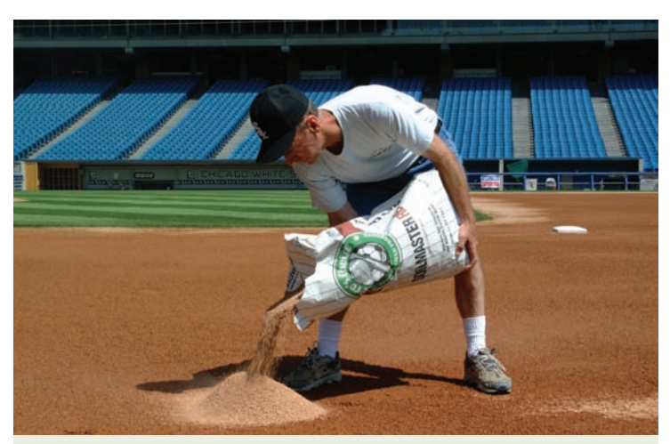
Bossard advises to look for a soil conditioner with good granule sizing, a deep red color and minimal dust. He's even helped develop his own special product.

Finally, the original design concept must not only keep the construction budget in mind, but the maintenance budget as well. Even the best designs will suffer if you can't afford to take care of them.