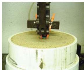
Flush with Surface