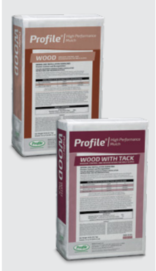
Made in Conover, North Carolina, USA