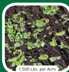
1,500 Lbs. per Acre