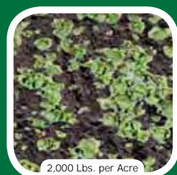
2,000 Lbs. per Acre