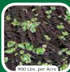
900 Lbs. per Acre