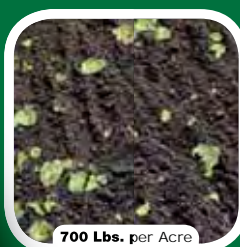
700 Lbs. per Acre