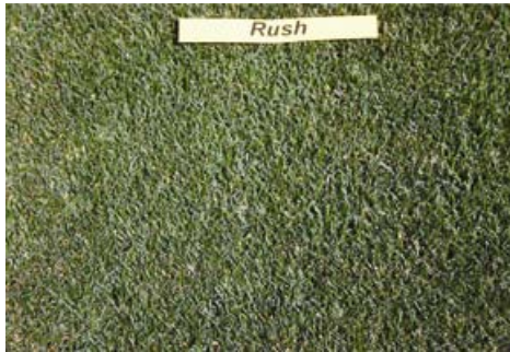
Rush Kentucky bluegrass

Rush is the only Kentucky bluegrass variety bred specifically for competitiveness with Poa annua , particularly under close, fairway-height mowing. Rush was tested as experimental J-2222 and is an elite hybrid of BlueChip Kentucky bluegrass.