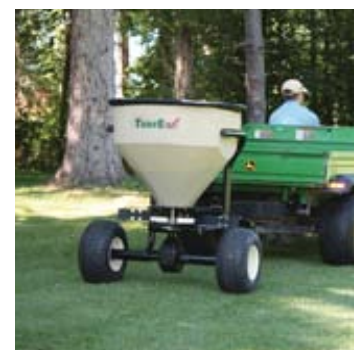
Magnified Product View