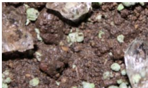
Magnified view of visible watering guide